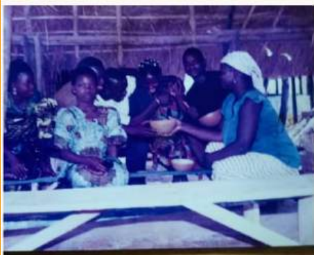
Mothers' day celebration, 1990